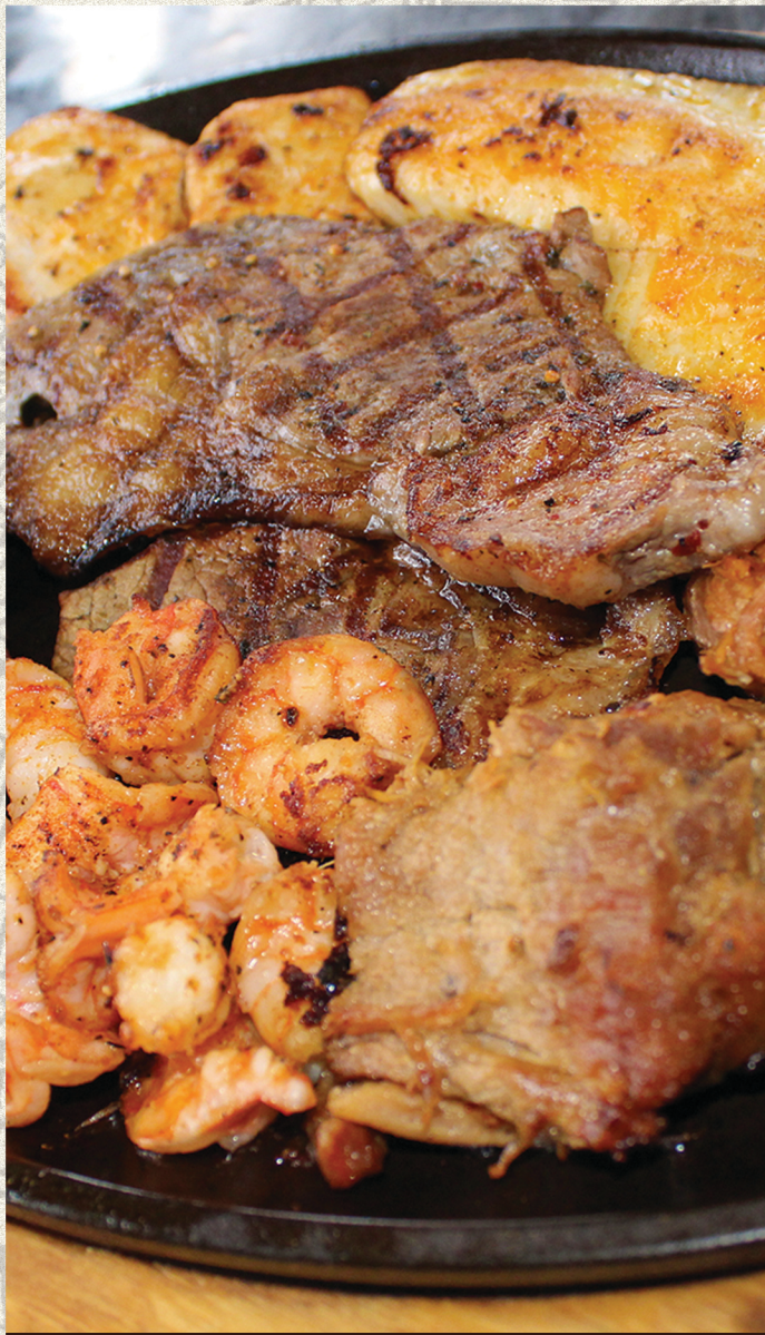
Los Agave's Special