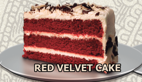
RED VELVET CAKE