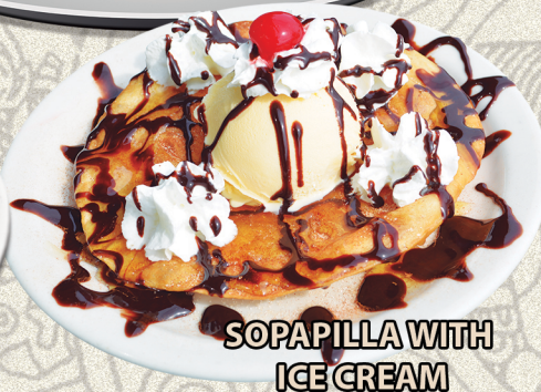
SOPAPILLA WITH ICE CREAM