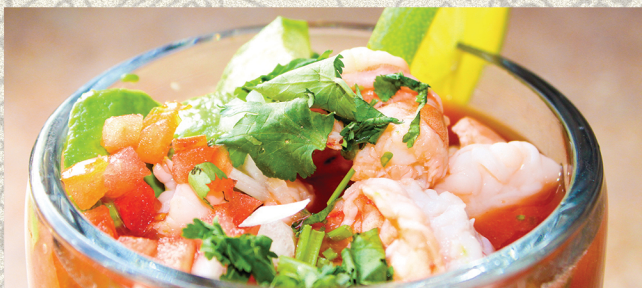
Cóctel de Camarones

Flour tortillas grilled and filled with cheese, grilled onion, peppers, tomatoes, and shrimp. Served with guacamole salad, sour cream, and rice. 14.00