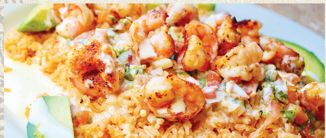
Camarones a la Mexicana

Consuming RAW or undercooked meats, poultry, seafood, shellfish or eggs may increase your risk of foodborne illness, especially if you have a medical condition. Please inform your server of any food allergies.