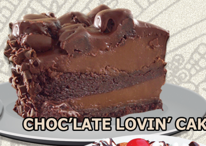
CHOC'LOTE LOVIN' CAKE