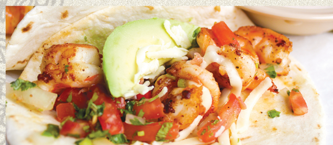
Special Fish or Shrimp Tacos